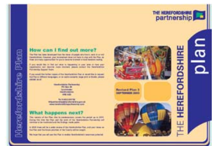
New look Herefordshire Plan