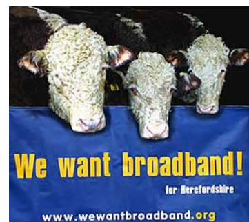
One of the broadband campaign's promotional pictures

A series of Herefordshire Business Roadshows took place during November, visiting market towns and Rotherwas. These generated a pleasing number of enquiries regarding the availability of grants as well as broadband—as being publicised by the Herefordshire In Touch project. A newsletter was also produced and sent to all businesses in the Business Directory in October, updating them on broadband, Pro-Grata grants and other services.