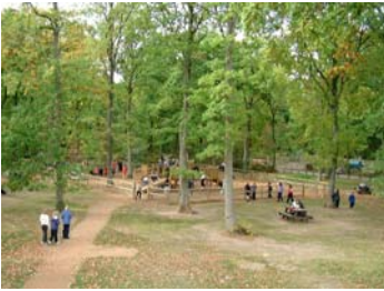
New play area attracts huge numbers to Queenswood

Following the completion of the first phase of site enhancements, record attendances were recorded at Queenswood and Bodenham Lake Country Parks.