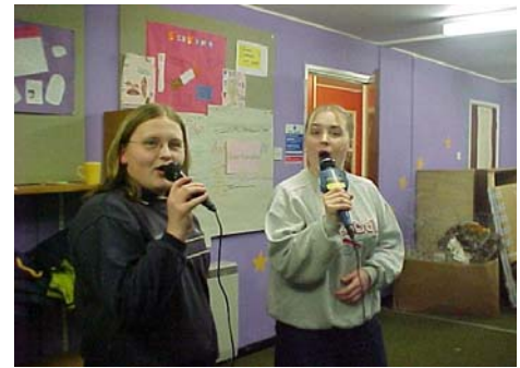
Music programme has been well received

Under the Duke of Edinburgh Award Scheme, youth workers, teachers and volunteers commenced training programmes to become expedition supervisors (BETA), and began preparing for their expedition camp outs during