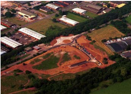
Improving the County's infrastructure, employment land and workspace provision

Work was taking place to set up a new scheme to provide financial assistance towards the conversion or upgrading of buildings for business use. When established, the team will administer the scheme on behalf of the RRZ Partnership within the eligible areas of Herefordshire, Shropshire and Worcestershire. The scheme will operate with an initial budget of £1.3M over the first three years. A manager and monitoring officer for this redundant building grant scheme have been appointed and the formal launch is planned for early this year.