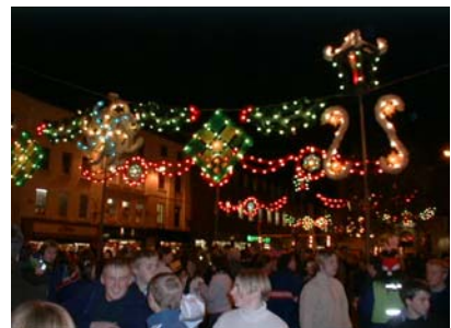
Market towns reminded of Christmas lights grants scheme.

The five market towns were approached and reminded of the Christmas Lights in the Market Towns Grant Scheme, where funding of up to £600 is available to assist