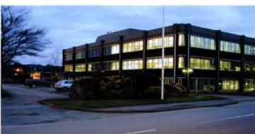
Plough Lane—Policy & Community's new home

During this period, the staff from the Directorate Support Unit concentrated upon the work required in order to prepare the Directorate for its relocation to the offices in Plough Lane, Hereford. As previously mentioned in Service News, the project plan for the move required the completion of over 600 tasks.