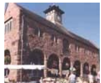
Ross Heritage Centre receives high numbers of visitors

Heritage /museum staff rated as good or excellent —again high satisfaction rate of 87% against the target of 70%